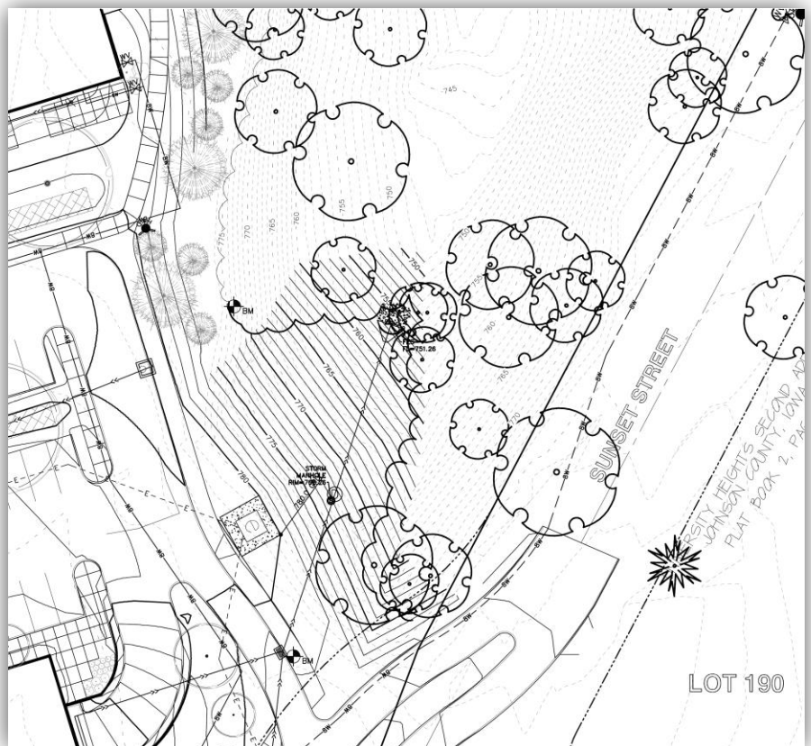
Figure 1: Grading Plan showing 3:1 slope and Tree Removal (Provided by MMS Consultants 2015-12-01)